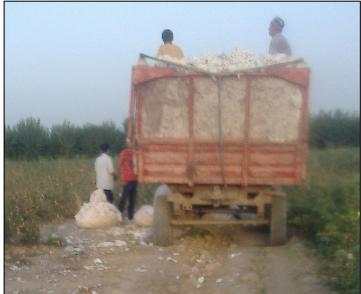
Trailer taking cotton from the field, October 2013.