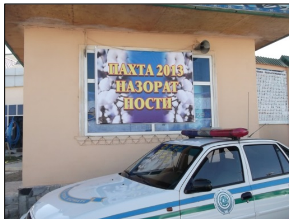
Police office to oversee the cotton harvest, Syrdarya region, September 2013.

fields to schools in anticipation of visits by the ILO. 97 Fergana regional authorities ordered all residents to have children pick cotton away from main highways. 98 In advance of an ILO visits to colleges, school officials sent the students back to school from the cotton fields. 99 A student wrote to Radio Liberty, “I am first-year student from Samarkand Judicial College. We were also sent to pick cotton. Our teachers told us that if the Commission comes we should say that we are second-year in the college. What is happening? It seems illegal.” 100