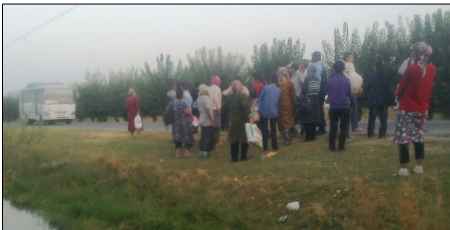
Teachers await transportation at the end of a day picking cotton, October 2013.

The tax inspectorate threatened private business owners with extraordinary investigations if they refused to contribute to the cotton harvest, forcing some businessmen to pay to hire day labourers to pick cotton in their place. 47 In September, local authorities in the Tashkent region, including the Prosecutor's Office and the Tax Inspectorate, convened business owners to present these demands and threaten tax penalties for those who failed to comply. 48 Authorities in Tashkent city gave vendors operating in city parks a choice: pick cotton for forty days in Syrdarya region, pay 1.6 million soums, or expect criminal charges. 49 The Tashkent authorities ordered the city's business owners to transfer money to the Mega Food Store, purportedly to support the purchase of food for cotton pickers. 50 In Surkandarya region, authorities ordered private businesses with ten or more employees to send as much as half of their staff to pick cotton. 51 In September, Trastbank sent one-fifth of its staff, and the Shurtanneftgaz gas exploration