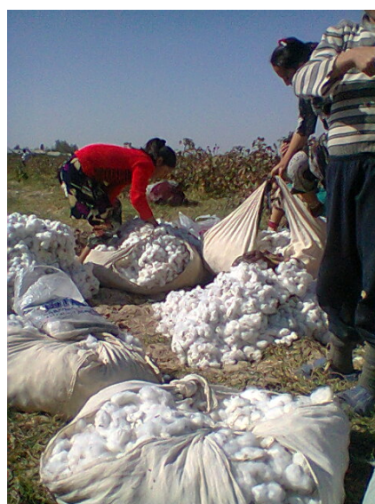
School administrators sent schoolchildren to pick cotton in Yakkabog district, Kashkadarya region, October 2013.