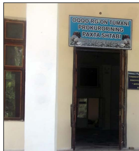
Prosecutor's Office, Akkurgan, Tashkent region, functioning as the district headquarters for the cotton harvest.

Teachers and other public-sector professionals participated in the cotton harvest to avoid losing their jobs or salary. 38 In May, administrators of schools, hospitals, power plants and other public-sector institutions in Jizzak and Tashkent regions sent teachers, doctors, nurses and other staff to plough and weed the cotton fields. 39 School administrators in Tashkent offered exemptions from springtime field work