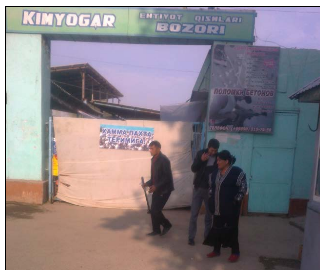
Closed market. The sign states, "Everyone goes to the cotton harvest!"

Many public institutions sent their workers to pick cotton for shifts of 10-15 days. 62 The regional governor of Namangan issued a statement on September 13 that all students of the three regional universities and all workers of private and public-sector institutions would pick cotton. 63 In a statement delivered at Tashkent's South Station on September 17, the Mayor of Tashkent ordered city residents to pick cotton in Jizzak region. 64 In Syrdarya region, local authorities closed markets to prevent people from avoiding work in the cotton fields. 65 In Kashkadarya region, authorities informed residents that