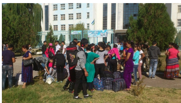
Mobilization of college students, September 16-17, 2013, Tashkent region.