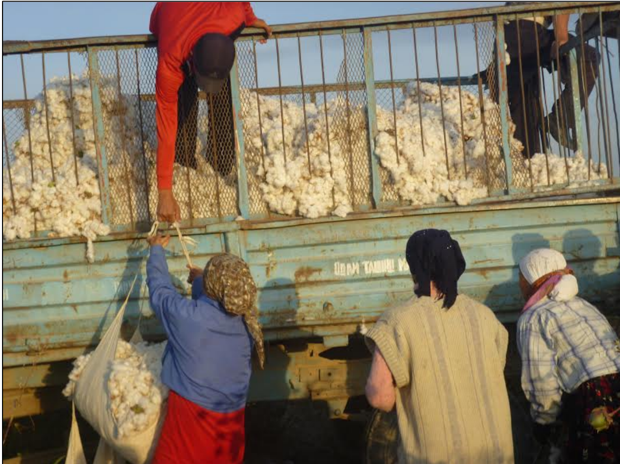
Delivering cotton to the trailer, October 2013.

buildings in the countryside. Adults and children often slept on the floors and reported a lack of washing facilities, heat, electricity and adequate food. A week into the harvest, children from Colleges in Tashkent fled the cotton fields because of the poor living conditions. Those with resources paid local residents 500-1000 soums ($0.23 - $0.47) per night to sleep in their houses Many students fell ill and were sent home early. 88