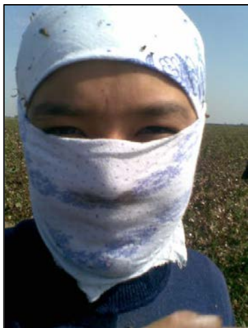
Teenager picking cotton, October 2013

cotton fields the authorities told us that representatives of international organisations might come and ask us questions, and that we must answer that we came to the cotton harvest to help out the state. In these circumstances, no one will tell the truth in the presence of government officials.” 105