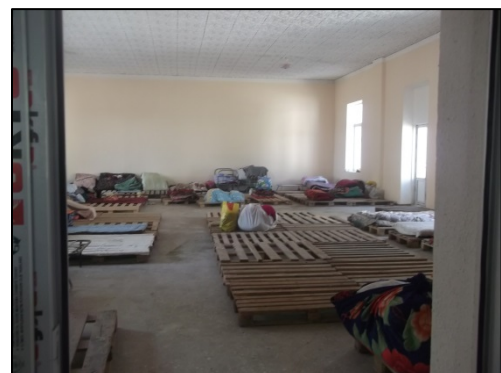
Accommodations for children and adults sent to pick cotton in Syrdarya region, September 2013.