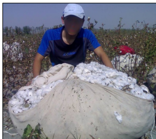
Teenager picking cotton, Andijan, October 2013.

As in previous harvests, in 2013 the government systematically forced children, primarily students from colleges and lyceums (aged 15 to 18), to pick cotton, under threat of expulsion from school. Children in Uzbekistan enter colleges and lyceums at age 15 or 16. 4 According to national statistics, 1.7 million students attended colleges and lyceums in 2012, and over one third of the first-year college and lyceum students were 15 years old. 5