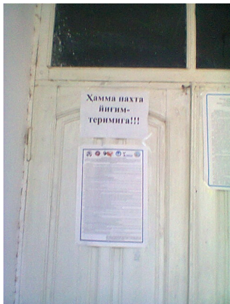
A college closed for the cotton harvest, Kashkadarya region, October 2013. The sign states, "Everyone goes to the cotton harvest!"