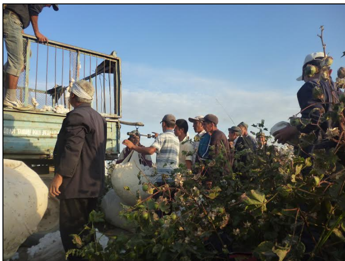
Weighing cotton, October 2013.

Many people were unable to pick enough cotton to fulfil their daily quotas and therefore had to pay farmers or local residents for the cotton they needed to make up the shortfall. In many cases, authorities also passed the cost of transportation and food to citizens sent to pick cotton. 70 Some students reported that school officials under-recorded the weight of cotton delivered. 71 As a result, many people forced to pick cotton contributed both their labour and their money to the state-controlled cotton harvest. Many who struggled to fulfil their cotton quotas also reported suffering verbal abuse, threats of punishment and, in some cases, physical abuse.