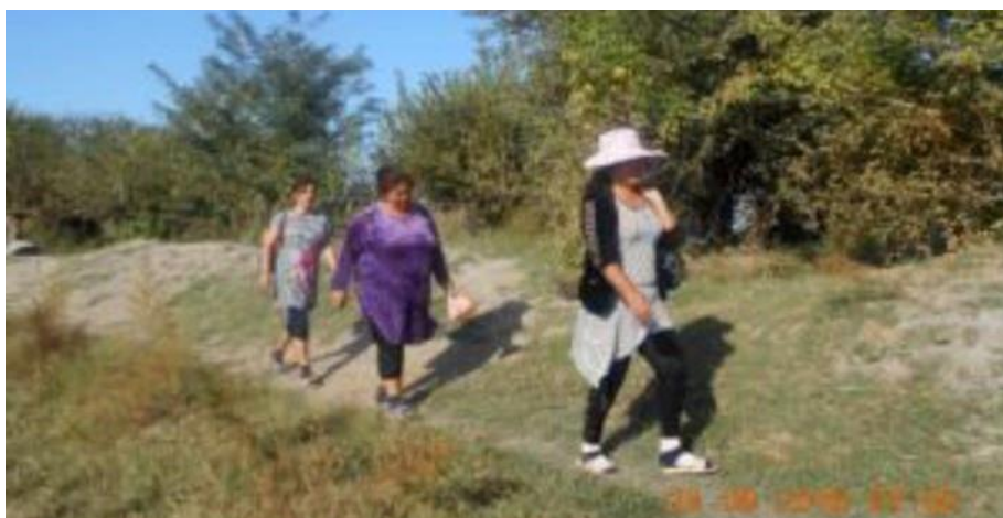
Employees from the Central Hospital in Dustabad on their way to the cotton field

Federation of Labour Unions has not reacted to these reports so far. 9 days passed from the day it was reported.