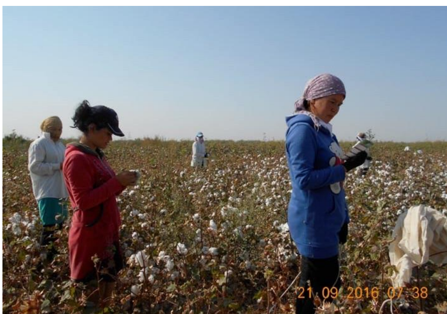
Cotton pickers reading information leaflets about the prohibition of forced labor 2016

When Elena arrived at the fields, there were cars and people in camouflaged