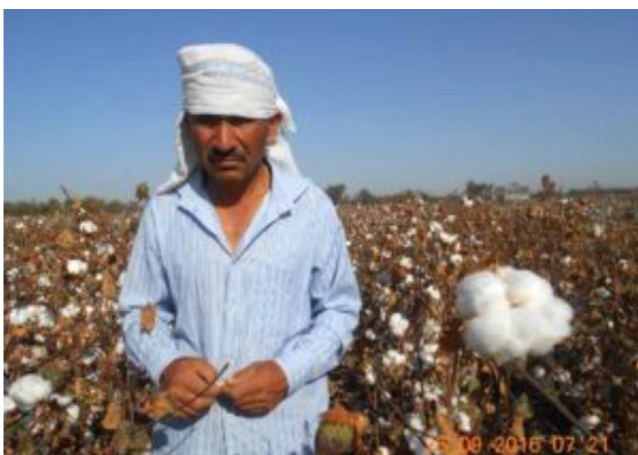
Doctor from the Central Hospital in Dustabad on the cotton field