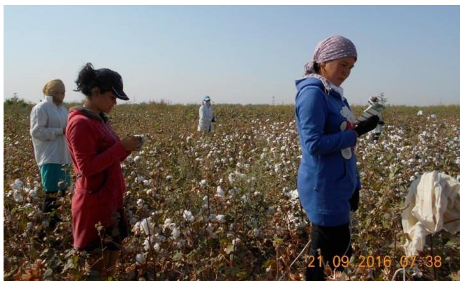
Cotton pickers reading information leaflets about the prohibition of forced labor 2016

September 28, 2016/in Regions, Tashkent Region, Teachers /