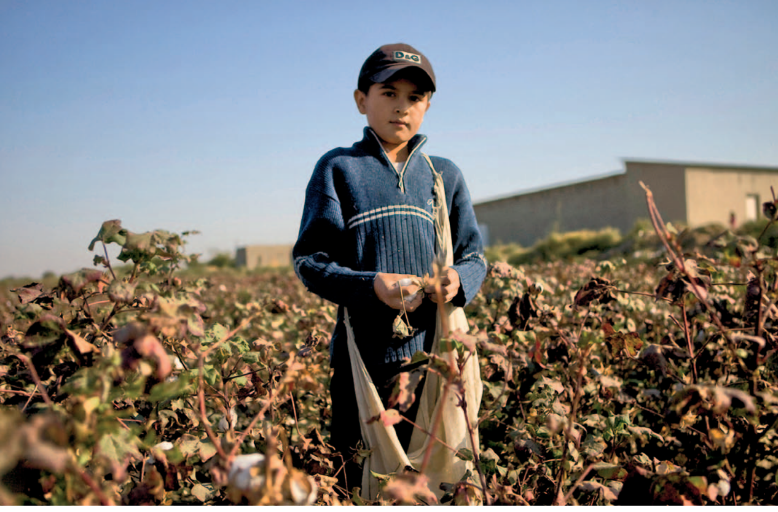
© Nicole Hill, Bukhara, October 2009