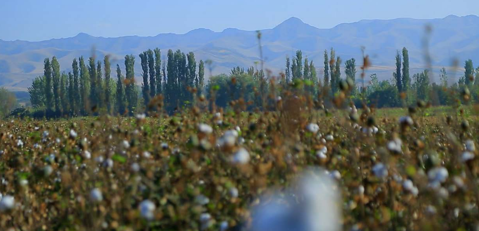
Cotton fields in Andijan, September 2023.

What transpired during 2023 was far from the promise made by Voitov. In the end, the purchase price of cotton was determined unilaterally by the clusters, seemingly in coordination with hokimiyats and the Ministry of Agriculture, who are responsible for ensuring contracts are concluded between farmers and clusters. Farmers received letters from clusters announcing a non-negotiable price for their cotton which varied from 6,000 to 8,500 UZS per kilo.