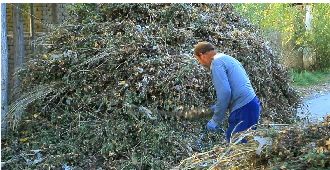
A farm worker transports cotton branches for heating in households. Andijan region, November 2023.

In mid-September, a leaked video 8 of a Zoom conference held by Shukhrat Ganiev went viral on the internet. During the meeting, the presidential advisor reprimanded the hokims of lagging regions for low rates of cotton harvesting and insufficient numbers of mobilized pickers. Ganiev’s speech implied that several regions could not mobilize tens of thousands of people to pick cotton and were significantly behind with the cotton harvest schedule. In particular, he remarked, “Out of 220,000 required pickers only 140,000 went out in Kashkadarya and only 100,000 out of the required 160,000 went in Bukhara.” During the meeting, Ganiev threatened the heads of the regions with criminal prosecution for failing to organize a timely and successful harvest: “Fergana, you have to harvest 11,500 tons according to the schedule. Only 8,300 tons have been harvested. Besharik, Baghdad, Yazavan, Rishtan, Kushtepa, Uzbekistan — summon the hokims to the prosecutor’s office. Open a criminal case against the hokim of Kuva district...”