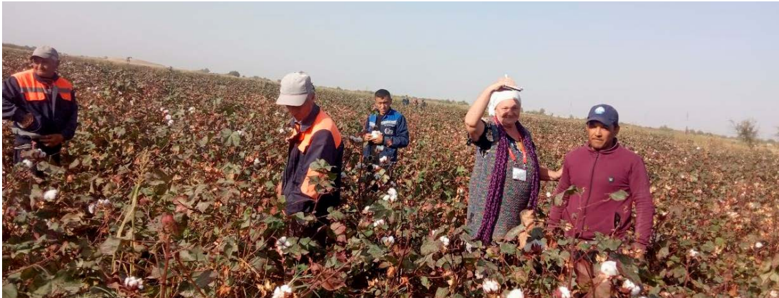
Pickers in Nishan, Kashkadarya, October 7, 2023.

Uzbek Forum monitors conducted interviews 19 with workers at the offices of Uchkuprik district electricity grid in Fergana region. As one employee explained, “The boss said I should go to pick cotton. Village women alone are not enough to pick all the cotton for the farmer. Cotton is our ‘wealth’ and we must pick it before the cold and rain come. And if I refuse, I’ll have problems with my boss. He’ll nag me about my work and might take away my bonus.” When asked if the worker had ever been punished for refusing to pick cotton in the past, he responded, “No, but I have never refused before. If they tell me to pick cotton, I go and do it.”