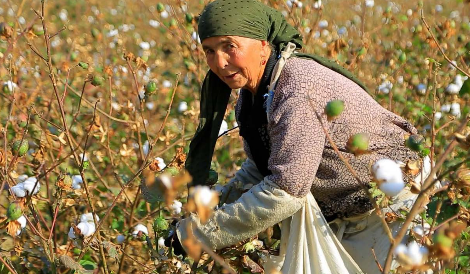
Cotton picker, Andijan region, October 2023.